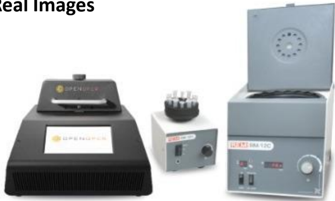
Model: RM 12C