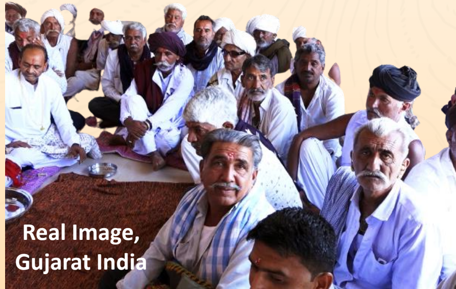
Real Image, Gujarat India

Haribol A2 Milk comes from these PROTECTED COWS