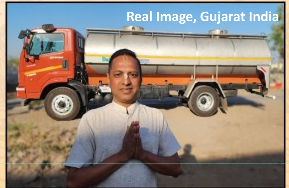
Milk Dispatched for Processing is Maintained at 4 0 C