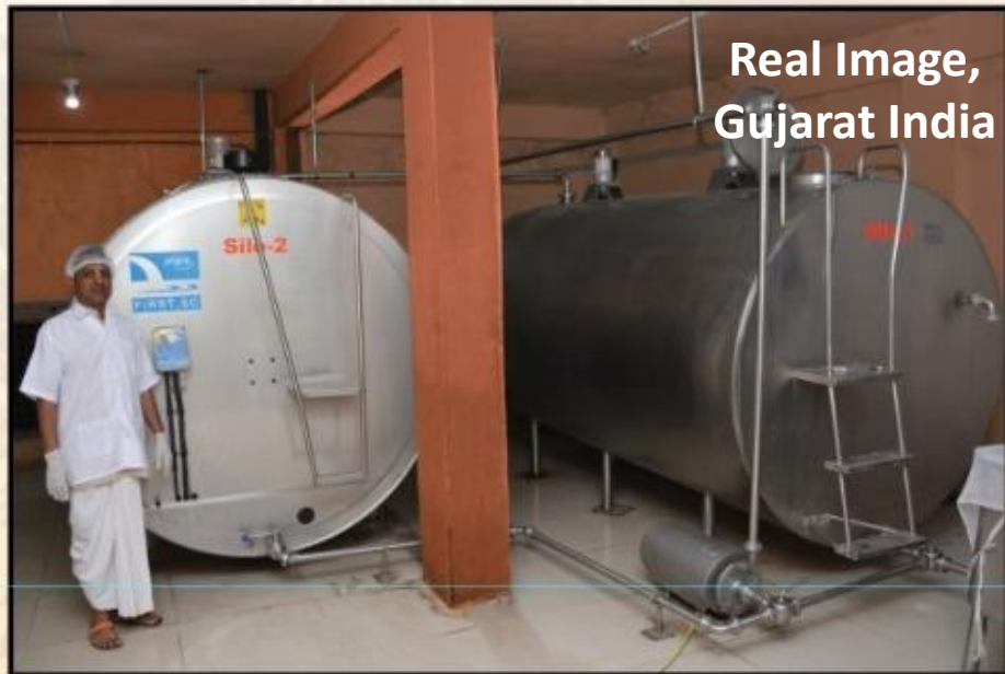
Haribol's Bulk Milk Cooler (BMC) Storing milk at 4 0 C